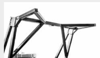
Mechanical push frame guides and pushes material away from carrier