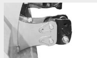
Extended 3 point linkage