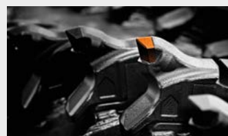
Multiple tooth options