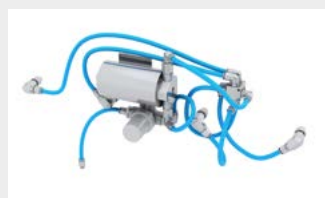
The Water Spray System (High Flow & FCS) has the dual function of cooling and mixing