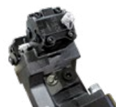
Front hydraulic hood with bolt-on chains/protection plates

VT motor to increase performance and reduce operating costs