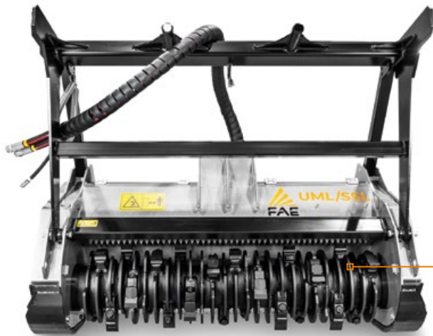
Rotor Bite Limiter