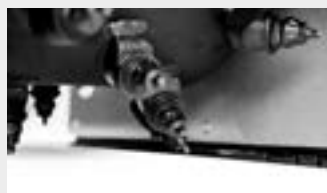
Teeth for working on concrete