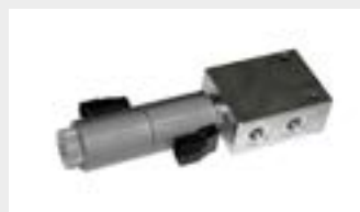
Diverter valve for depth control