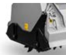
Adjustable right skid for correct head alignment in overlaps