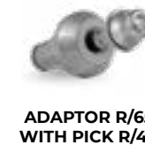
ADAPTOR R/65 WITH PICK R/44 (option)