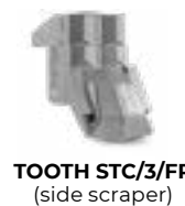
TOOTH STC/3/FP (side scraper)