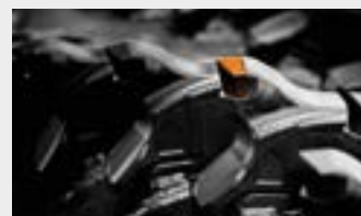
Multiple tooth options