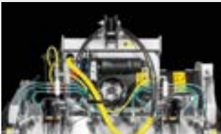
The Water Spray System (High Flow & FCS) has the dual function of cooling and mixing