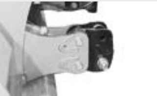
Extended 3 point linkage