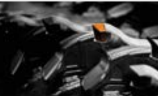
Multiple tooth options