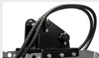
Customized attachment bracket kit with customized pins