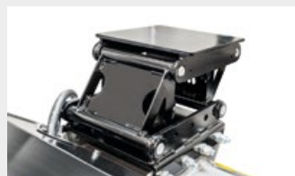
Attachment plate with self-leveling device (optional) adapts to all types of terrain