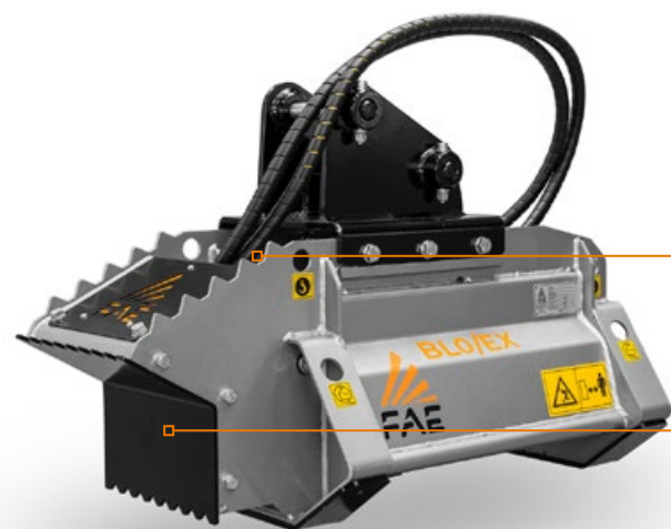
Hydraulic block with flow control valve in the motor