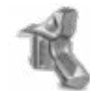
TOOTH G/3 (standard)