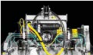
The Water Spray System (Basic & High Flow) cools the teeth to help them last longer