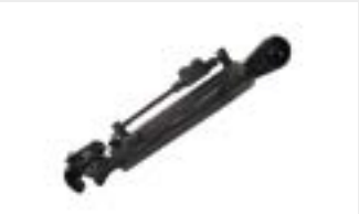
Hydraulic top link

Max. 1: with rotor only Max. 2: maximum depth (maximum working depth depending on ground conditions). This information refers to the machine equipped as standard. The technical data in this catalogue may be altered without prior notice.