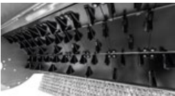
Interchangeable bolted on spike counter blade can adjust final product size while operating