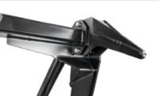
Extra ripper for push frame