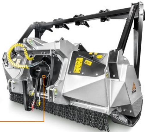
Z style self ranging system of the PTO drive shaft/gearbox always keeps the correct operating angle between the PTO shaft and the power take-off (optional)