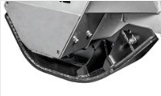
Special skids to go underground