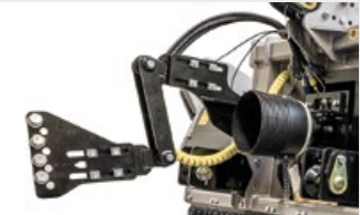
W style self aligning device between PTO drive shaft/gearbox allows the mulcher to work at several angles without damaging the PTO