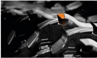
Multiple tooth options