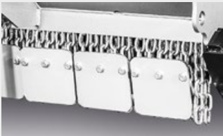
Bolt-on chain's protection plates