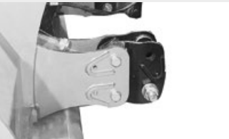
Extended 3 point linkage