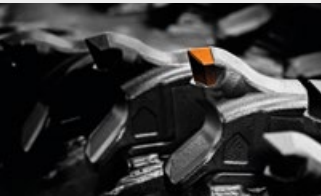
Multiple tooth options