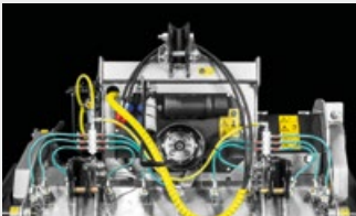
The Water Spray System (High Flow & FCS) has the dual function of cooling and mixing