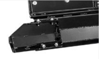
Dozing blade to level the crushed material