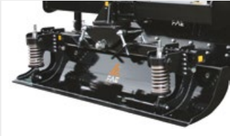
Grader blade (road kit) for grading and compaction