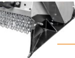
Penetration skids help the machine to better penetrate the soil