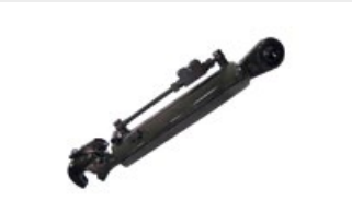
Hydraulic top link