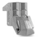
STC/3/FP (side scraper)