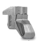
STC/3 (side scraper)