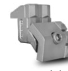
STC/3/SS (side scraper)