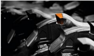
Multiple tooth options