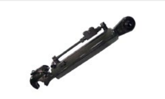
Hydraulic top link