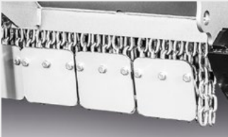
Bolt-on chain's protection plates