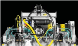
The Water Spray System (Basic & High Flow) has the dual function of cooling and mixing