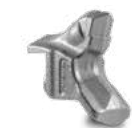
TOOTH G/3 (standard)