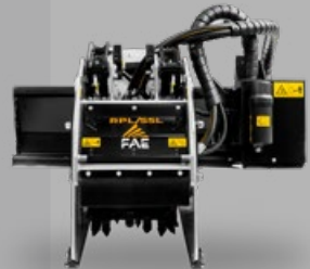
Fixed tooth road planer for the RCU75 remote controlled tracked carrier