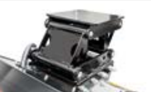
Attachment plate with self levelling device to adapt to all types of terrain