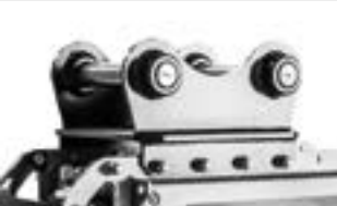
Customized attachment bracket