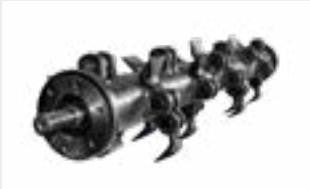
Possibility to have the rotor equipped with PML hammers or Y-flail