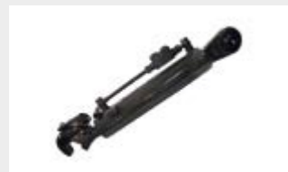
Hydraulic top link