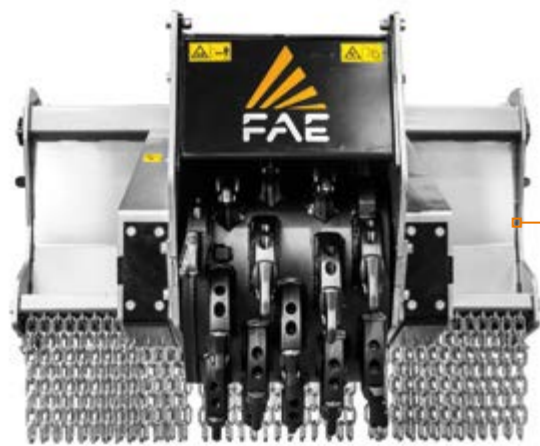
Transmission with belts