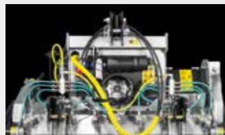
WSS Basic water injection system to reduce dust and cool the teeth