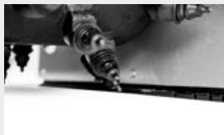
Teeth for working on concrete