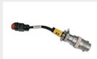
Wiring adaptors Wiring adaptors interface to allow a Plug & Play coupling with the most popular skid steers