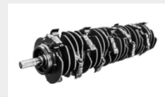
Bite Limiter rotor additional reinforced side plates for extreme conditions