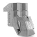
TOOTH STC/3/FP (side scraper)