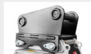
Customized attachment bracket