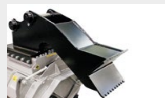
Customized attachment bracket with fixed thumb