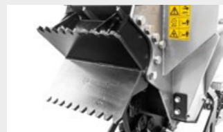
Front fixed thumb