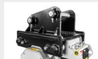
Customized attachment bracket