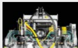
WSS Basic water injection system to reduce dust and cool the teeth