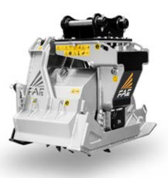
Attachment with self-levelling system for the correct alignment of the head during work

a wide-stroke self-leveling system to keep the head properly aligned while in operation, and teeth specifically designed for asphalt and concrete road surfaces.