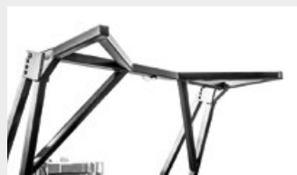
Mechanical or hydraulic guard frame guides and pushes material away from carrier