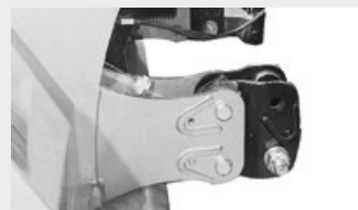
Extended 3 point linkage