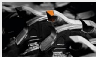
Multiple tooth options