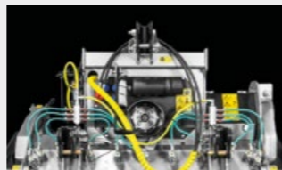
The Water Spray System (High Flow & FCS) has the dual function of cooling and mixing