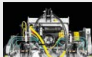
WSS Basic water injection system to reduce dust and cool the teeth