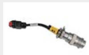
Wiring adaptors Wiring adaptors interface to allow a Plug & Play coupling with the most popular skid steers