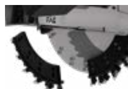
Modular cutting discs of 3, 4 or 5 inches