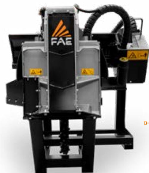
Hydraulic drive system for accurate positioning over the work area