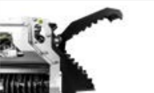
Thumb bracket and hydraulic thumb useful in moving material to be mulched