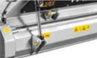
Hydraulic front hood for optimal mulching, reduces the ejection of mulched material