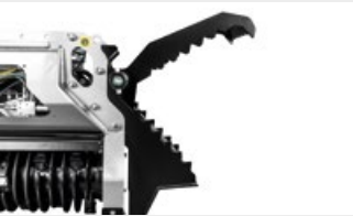
Thumb bracket with hydraulic thumb for handling material