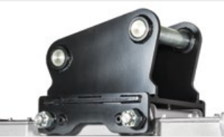
Customized attachment bracket