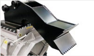
Customized attachment bracket with fixed thumb