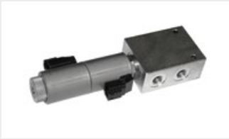
Diverter valve system to control the opening and closing of the front and rear hydraulic door