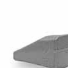
TOOTH BAZ (side scraper)