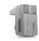
TOOTH STC/FP (side scraper)