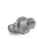
PICK R/65 (option)