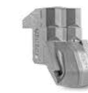
TOOTH STC/3/FP (side scraper)