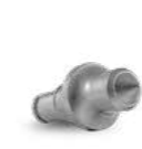
PICK R/65/HD (option)