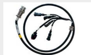
Wiring adaptors Wiring adaptors interface to allow a Plug & Play coupling with the most popular skid steers