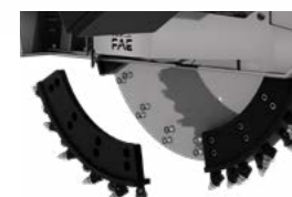
Modular cutting discs of 3, 4 or 5 cm