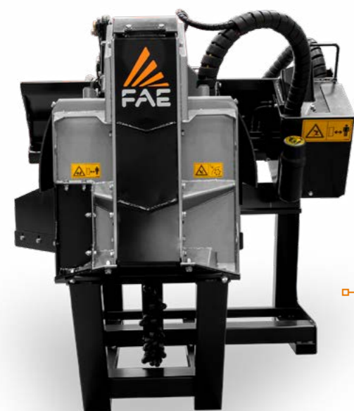
Hydraulic drive system for accurate positioning over the work area