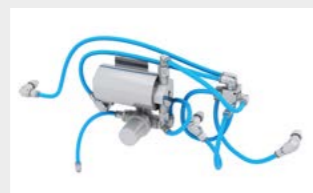
WSS Basic water injection system to reduce dust and cool the teeth