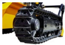
STEEL TRACKS (option)

Hydraulic variable track system with independent undercarriage frames and an automatic tensioning system built to work in the toughest conditions, thanks to a rubber or steel tracks structure, multiple roller system and idlers.