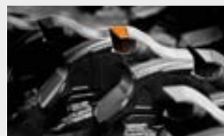
Multiple tooth options