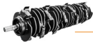
Rotor with Bite Limiter technology maximum productivity using the least amount of power