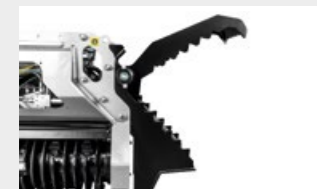
Thumb bracket with hydraulic thumb for handling material