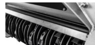
Dedicated rear hood (deflector) controls mulched material output for greater safety

Timing belt transmission optimal power transfer