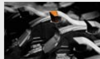
Multiple tooth options