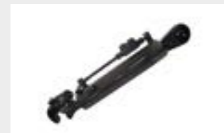
Hydraulic top link