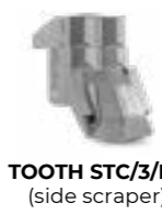
TOOTH STC/3/FP (side scraper)