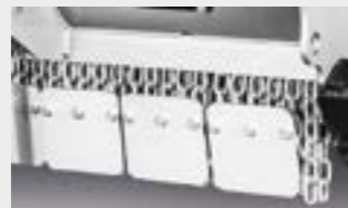
Bolt-on chain's protection plates