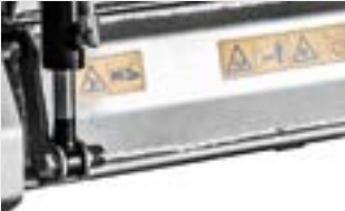
Hydraulic front hood