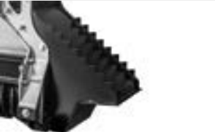
Excavator stand and thumb bracket useful in moving material to be mulched