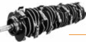
Bite Limiter rotor special steel limiter rings control the depth of cut