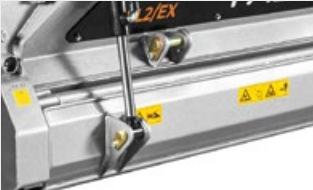
Hydraulic front hood for optimal mulching, reduces the ejection of mulched material