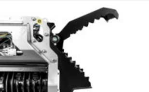
Thumb bracket and hydraulic thumb useful in moving material to be mulched