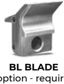
BL BLADE (option - requires adaptor)