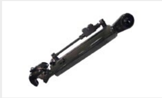
Hydraulic top link precise control over operations