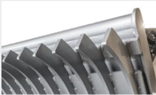
Rear hood grill allows larger material to be held back and crushed again for optimum results