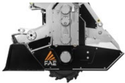
Side reduction gears and central gearbox with oilcooling system maximum productivity and efficiency maintained in all workingconditions