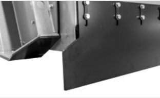
Adjustable steel dosing blade perfect distribution of the crushed material