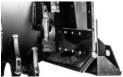
Interchangeable Hardox® anti wear plates quick and easy maintenance