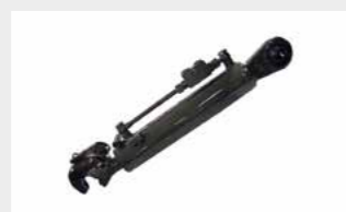
Hydraulic top link