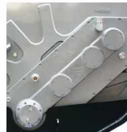
Dual transmission with side gearbox increase power delivery to the rotor