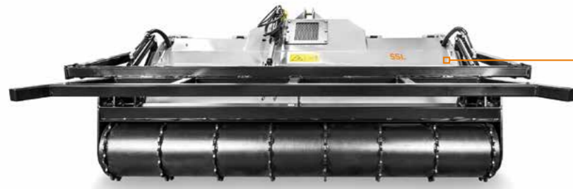
Adjustable counter-blade for longer working life