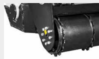
Hydraulic controlled roller helps with compaction and working uneven terrain