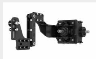
W style self-aligning system