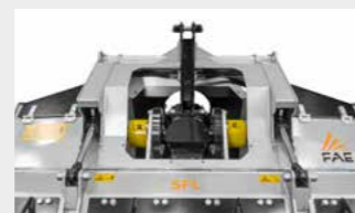
Z style self-aligning system