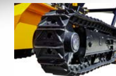
STEEL TRACKS (option)

Hydraulic variable track system with independent undercarriage frames and an automatic tensioning system built to work in the toughest conditions, thanks to a rubber or steel tracks structure, multiple roller system and idlers.