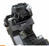
Front hydraulic hood with bolt-on chains/protection plates

VT motor to increase performance and reduce operating costs