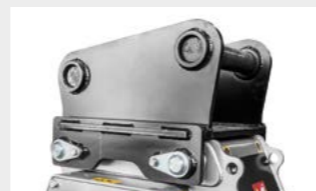
Customized attachment bracket